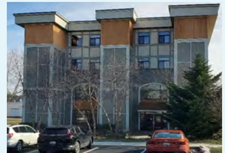
Roosevelt Commons Elkridge, MD