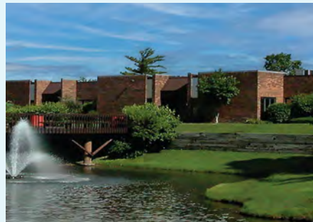
Arlington Heights Executive Center Arlington Heights, IL