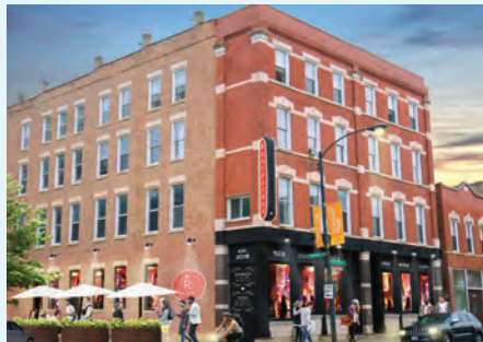
Noble Square Apts. | Chicago, IL