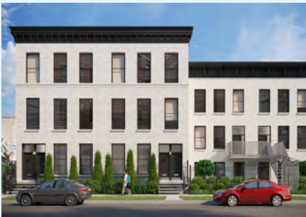
Altgeld Avenue Apts. | Chicago, IL

Characteristics: Stabilized, Opportunistic/Value-Add