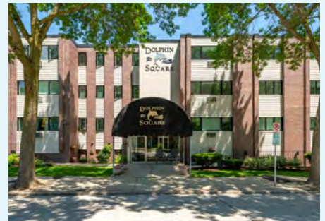
Dolphin Square Apts. | Waukesha, WI