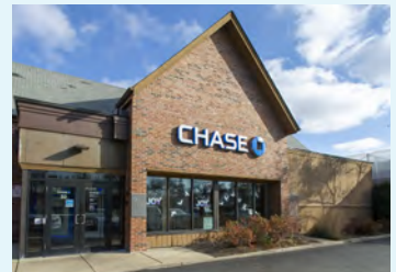
Wilmette Commons Wilmette, IL