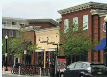
Potomac Greens Alexandria, VA