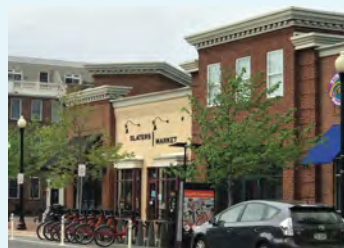
Potomac Greens Alexandria, VA