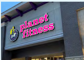
Kings Automall Cincinnati, OH

Characteristics: Stabilized or Value-Add