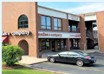
Essex Square Madison, WI