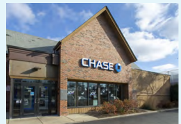
Wilmette Commons Wilmette, IL