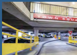
TOWN SQUARE GARAGE ST. PAUL, MN