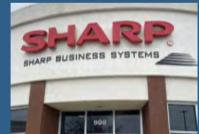
86TH STREET BUSINESS CENTER INDIANAPOLIS, IN