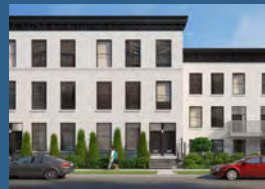
ALTGELD AVENUE CHICAGO, IL